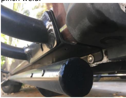
Figure 3: Lower Attachment Installation