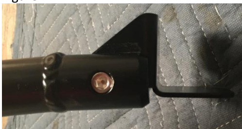
Figure 2: Ladder Attachment to Upper Brackets